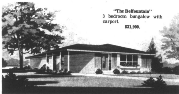
"The Belfountain" 3 bedroom bungalow with carport. $31,900.

It's our big day at "The Homesteads of Sheridan" on Sunday, October 17th and your big chance for a free "Balloon Ride" and a "Birds Eye View" of our GRAND OPENING. Open from 10 a.m.