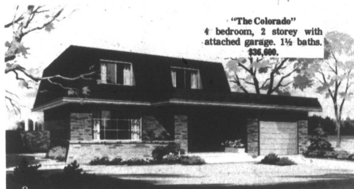
"The Colorado" 4 bedroom, 2 storey with attached garage. 1½ baths. $36,600.