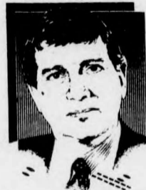
Federal Secretary of The New Democratic Party of Canada