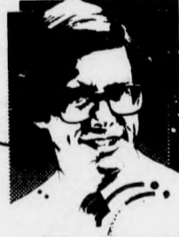
Intellectual heir to the late Ayn Rand