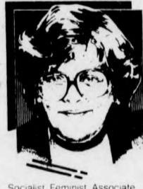
Socialist, Feminist, Associate Director of the Institute of Canadian Studies in Ottawa