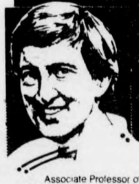
Associate Professor of Economics and Intellectual History at York University

STATE MANAGEMENT OR LAISSEZ-FAIRE? THE STATE AS PARENT OR THE STATE AS PROTECTOR? COLLECTIVE INTERESTS OR INDIVIDUAL RIGHTS? WE ARE OUR BROTHERS' KEEPER OR WE ARE NOT. Put into practice, these volatile alternatives effect your everyday life. They determine how much control you will have over your future. Taxpayer or student, here is the opportunity for you to see what alternatives you face. 'DEBATE 1984' will clearly draw the battle line on the grounds of fundamental moral principles during a candid exchange that will bring the house down! Don't let this rare opportunity go by. 'DEBATE 1984' will be the debate of the 80's. BE THERE!