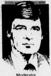
Moderator, Dean of the School of Journalism, The University of Western Ontario.