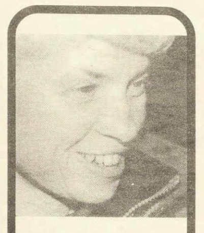
"Definitely. It may be fighting against a high tide, but it is a useful idea."