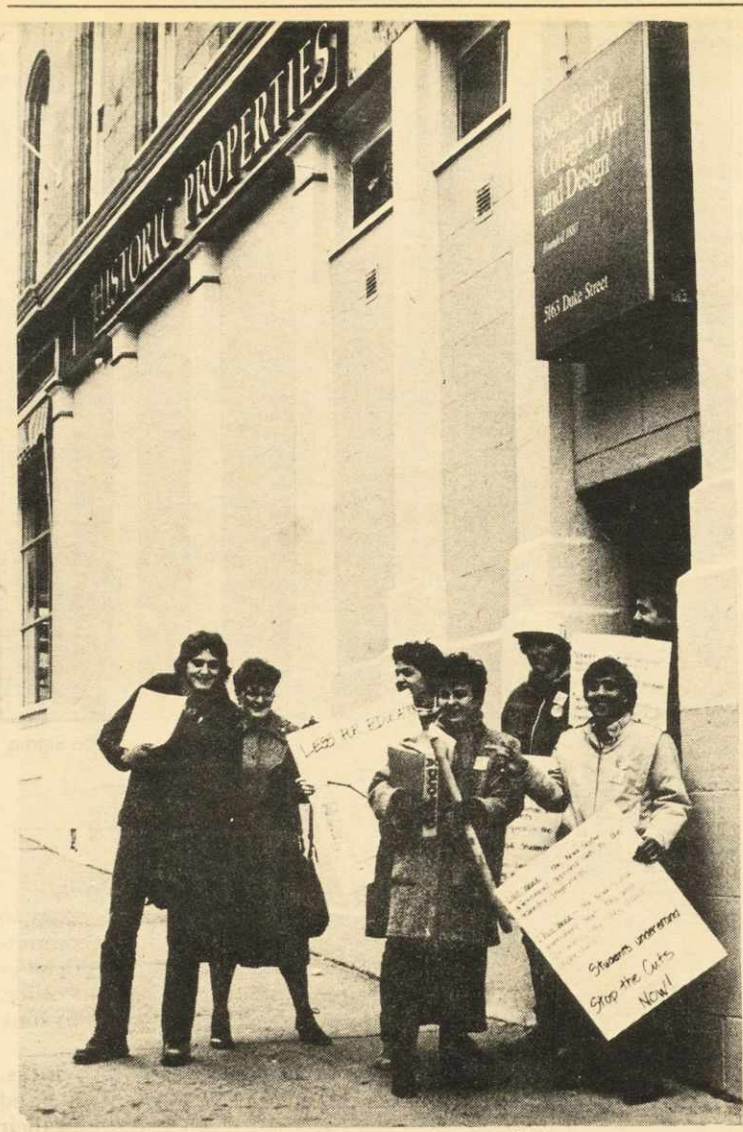
Student representatives from across the city prepare to march from NSCAD to the World TRade and Convention Centre to protest education cutbacks.