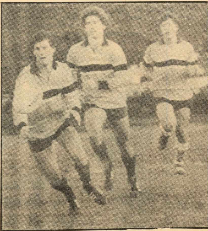
Rugby action. Dal

"That was the worst rugby we've played all season," said