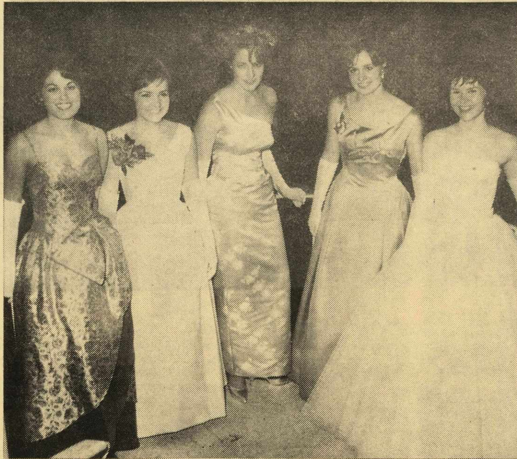
PRINCESSES EN MASSE