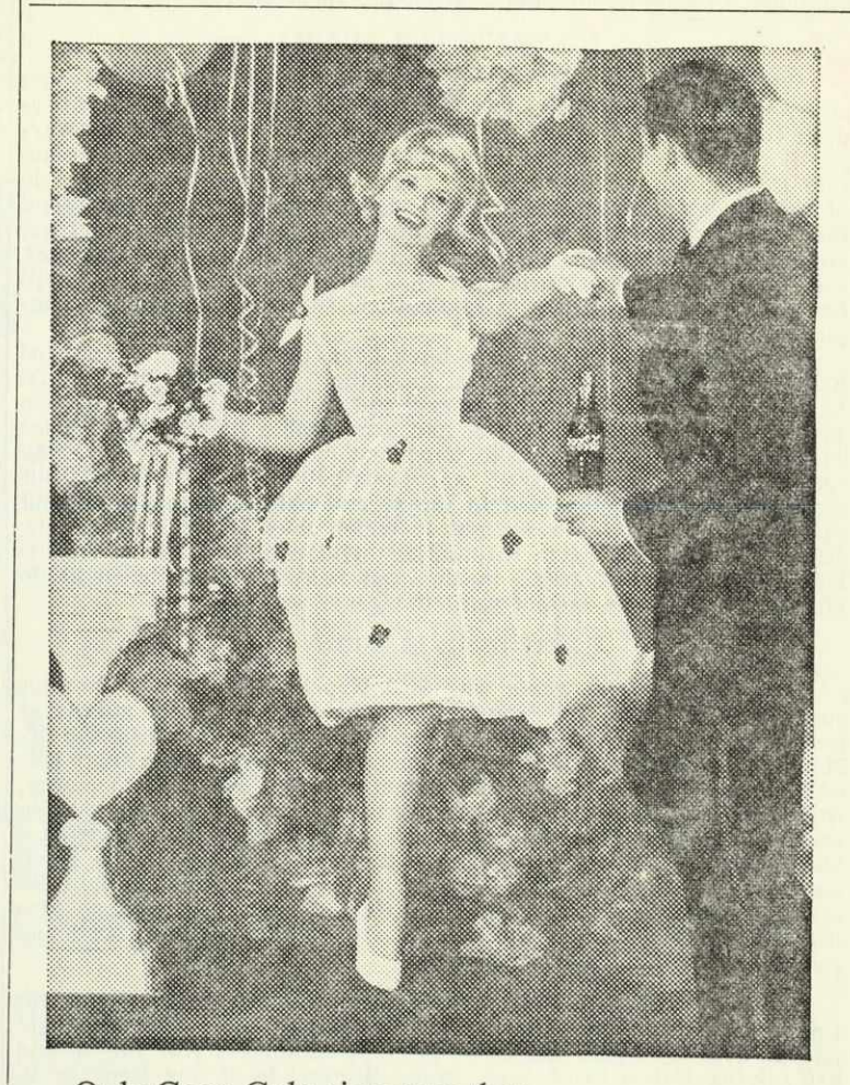
Only Coca-Cola gives you that

now at your Philips tape recorder dealer.