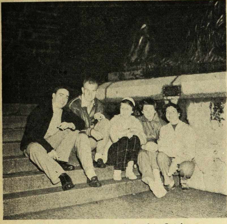
The freshmen were welcomed in October