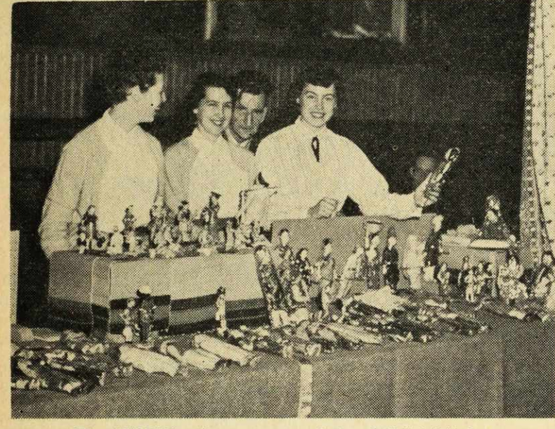
The WUSC sale was one of the fall highlights