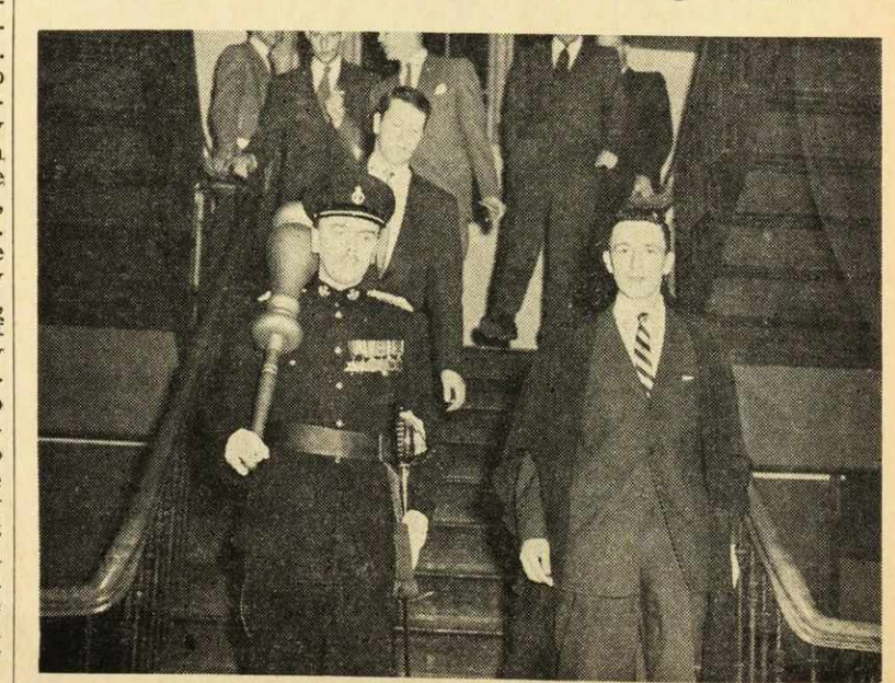
The Law School Mock Parliament was again a success