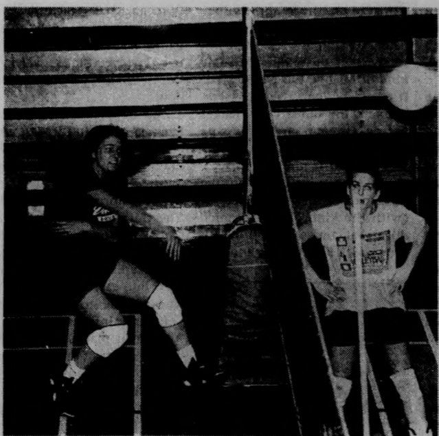
The V-Reds prepare for their tournament.