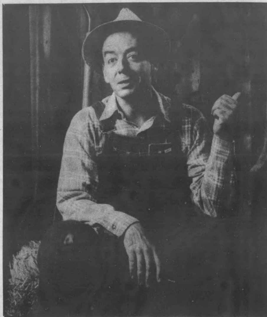
"Darn me if there isn't some idiot out there with a collander on his head!" - One of the observations in a letter from Wingfield Farm.