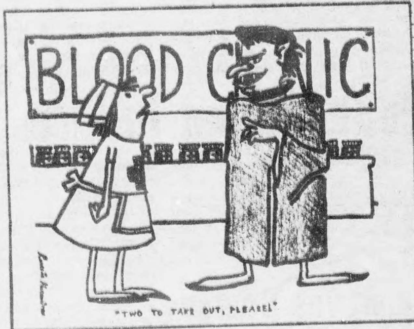
LOVE WITH A BAND-AID

Once again, the Pre-Med Club has become involved with the biannual Blood Donor Clinic on campus. To tell you the truth, I am a complete newcomer to the organizing of a clinic, having only been personally involved with giving blood before.