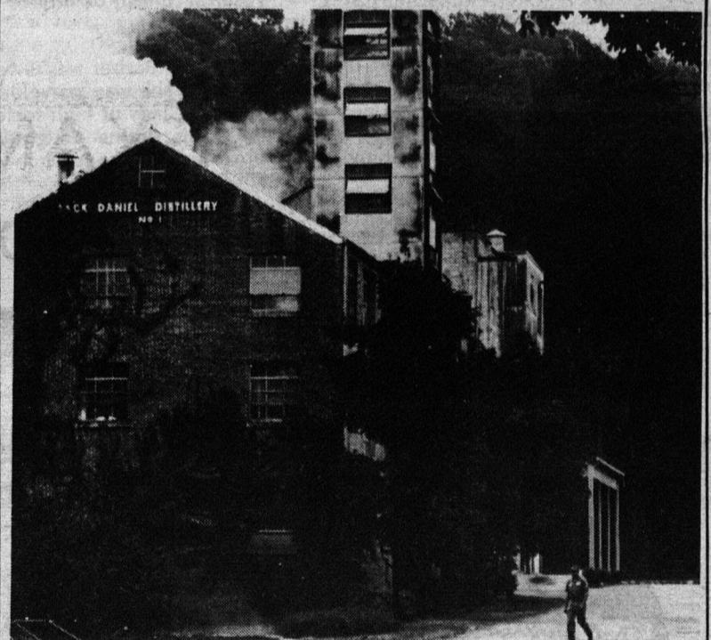
Jack Daniel Distillery. Named a National Historic Place by the United States Government.

AT THE JACK DANIEL DISTILLERY, we have everything we need to make our whiskey uncommonly smooth.