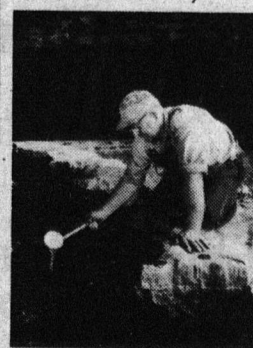
Our own iron-free water.

AT THE JACK DANIEL DISTILLERY, we have everything we need to make our whiskey uncommonly smooth.