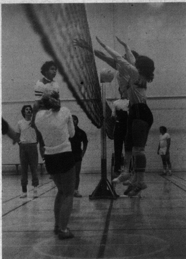
Foul! Intense action marked the res volleyball tournament. Reaching over the net as in the photo above was punishable by loss of the point and one digit.