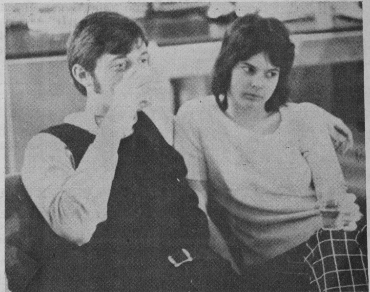
Contestant (L) consumes meal, while his partner (R) keeps eye on cashier.

"The Yule Log II" - can be played individually or in teams; competition is run by the rules and regulations as set down by the House Committee of Fifth Floor, Henday. The "end product" will be judged for technical merit