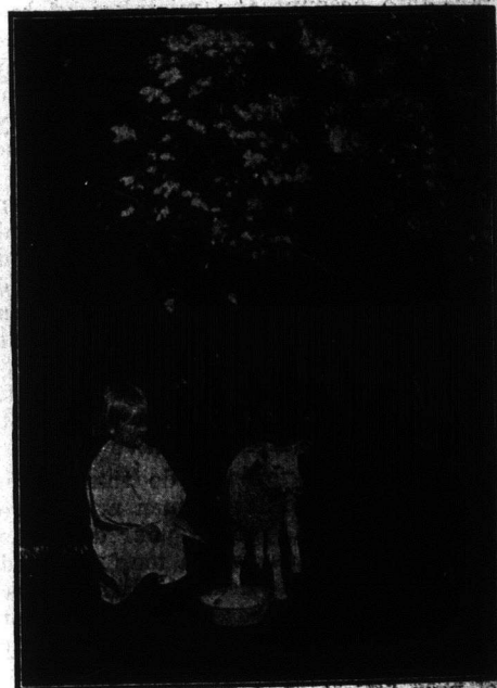
Mary's little lamb.

The farm boy is nearly 6 pounds heavier than the freshman, and 9 pounds more than the average student. His shoulders are broader, his chest measure, inflated, is nearly an inch above average, and an inch and half more than that of the freshman. His waist measure is almost two inches greater than the freshman's and an inch