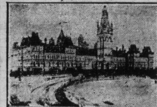
HOUSE OF COMMONS, BURNED FEB. 3, 1916. NOW BEING RESTORED TO FORMER BEAUTY.