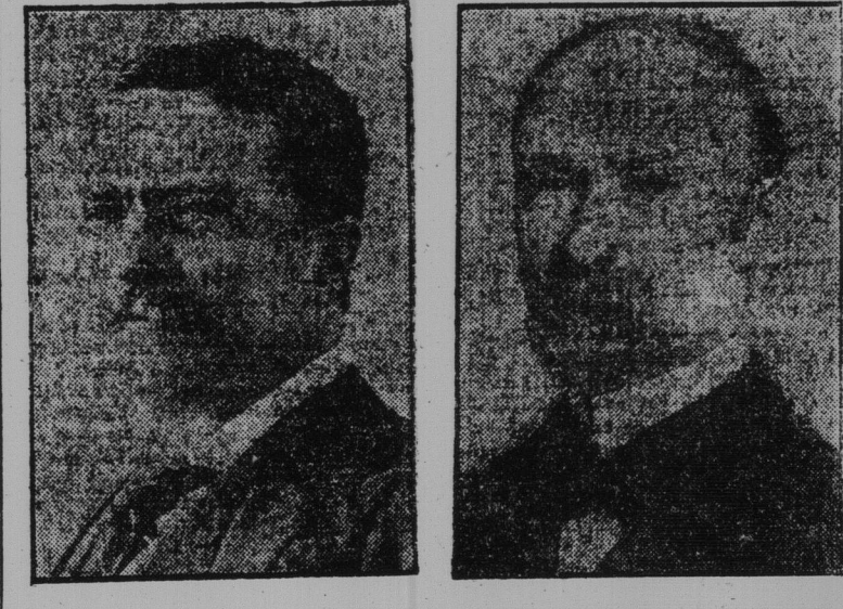
PRESIDENT ROOSEVELT. VICE-PRESIDENT FAIRBANKS.

Inauguration of Roosevelt and Fairbanks Was a Gorgeous Affair--Enthusiastic Thousands.