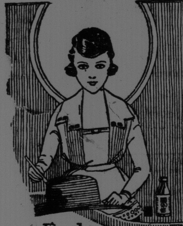
Fresh and Dainty

"Mio Dios, I should think so. At the sight of the horrible thing skipping over the white caps, without flapping its wings, and spitting fire from both sides of its body and roaring like 30,000 bulls we all took to the timber where we re-