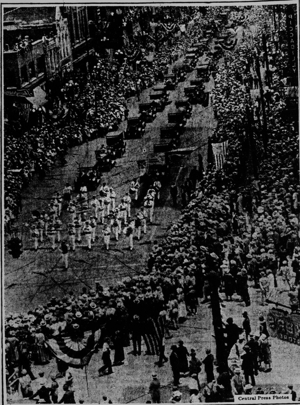
Four thousand two hundred United Confederate Veterans marched in the Grand Parade which served as the climax for the thirty-sixth annual reunion of the Confederate vets of '61, at Birmingham, Ala. Twenty thousand others, unable to march, participated, while it is estimated crowds of more than 200,000 witnessed the grand review of the gray clad veterans.