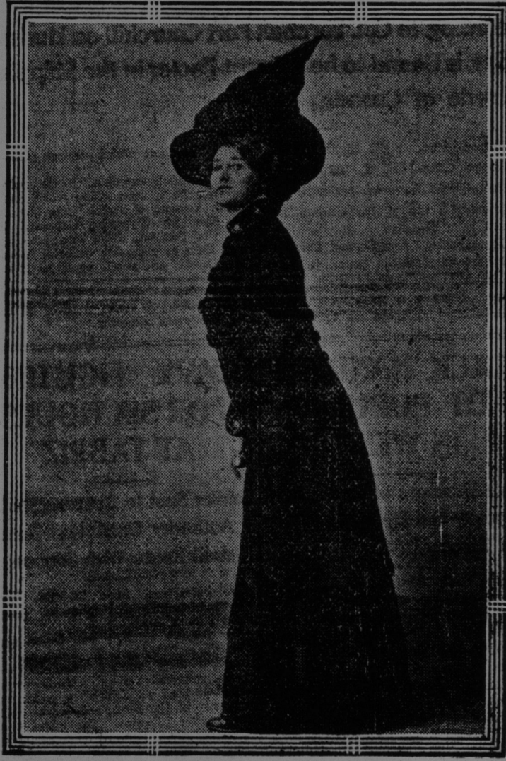
PEDESTRIAN SUIT OF CHEVRON WORSTED.

There are so many materials shown this season for the making of tailored costumes that many women find it difficult to choose just the right thing for the season. However, if one of the fancy English worsteds be chosen one cannot go wrong, because these materials are practical as well as high styled, and whatever their development they are sure to prove entirely satisfactory to the woman who wears them. A suit of such material should be developed along simple lines. Brads of the simpler kind are used to ornament the collar and outline the coat edges. Another use of braid in this connection is in the large fancy buttons made of soutache used simply as ornaments on the garment.