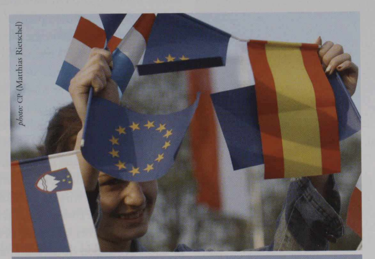
A girl waves the flags of EU countries during an EU enlargement party in Zittau, Germany, marking the official entry of bordering Poland and the Czech Republic into the EU.