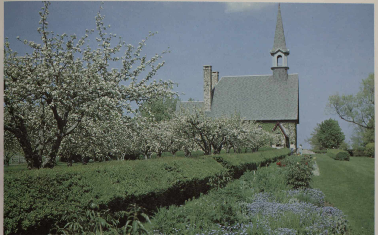
Evangeline Church, Grand Pré, Nova Scotia.