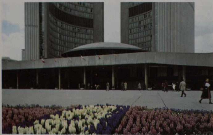
Hyacinths, Toronto City Hall.