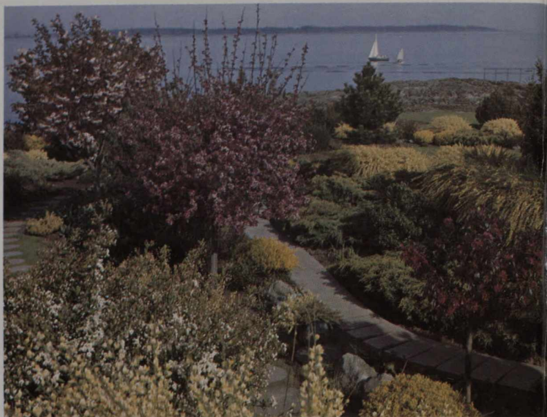
Victoria, British Columbia.