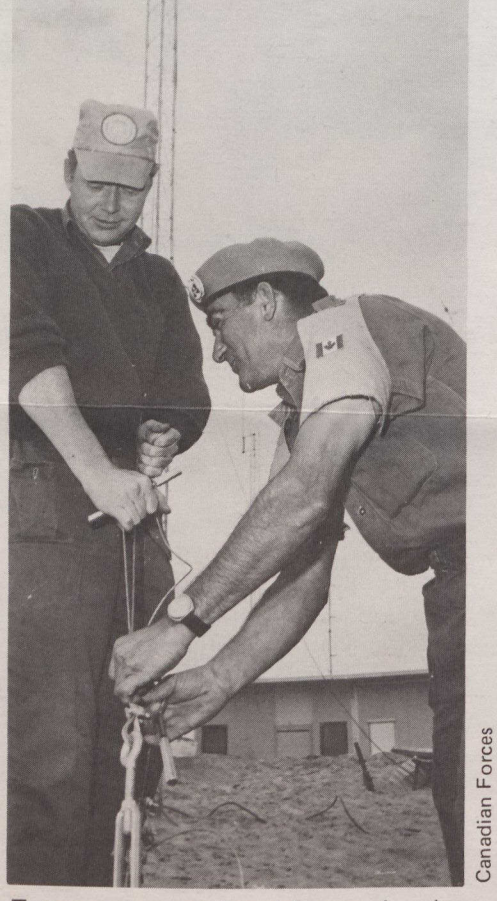
Two members of Canada's peacekeeping force in the Middle East at work anchoring an antenna. Today, there are 755 Canadians taking part in peacekeeping operations in the Middle East and Cyprus.

With over 20 years of experience as a peacekeeper, Canada has been an active proponent of reform in the ways of