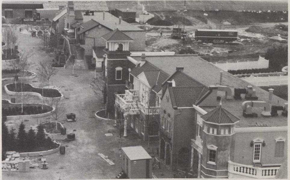
An aerial view of Canada's Wonderland taken in October 1980.

Canterbury Theatre in Medieval Faire (a castle outside, a modern 1,100-seat theatre inside) will be home to a 40-minute musical, Those Magnificent Movies , presented by 20 singers and dancers in more than 200 costumes. That works out to a different costume every