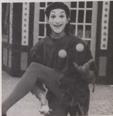
Some attractions are free.