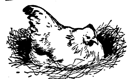
THE SETTING HEN—Her failures have discouraged many a poultry raiser.

You can make money raising chicks in the right way—lots of it.