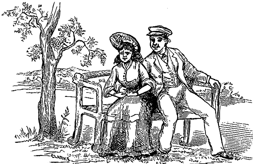
Patent Compressor—Found on Every Farm in the Country.

Scene showing the Binder when fully at work, Encircling the precious grain, without any shirk; The sheaf is compressed to any size desired, And the man with the reins never gets tired.