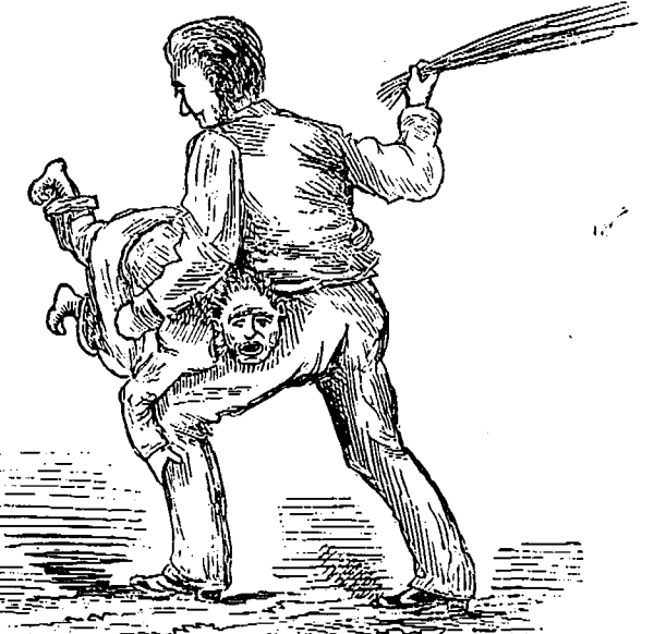
Butt Raker for 1883.

There is a prisoner in the county jail they call "Emptings," because he broke into a grocery and raised flour.