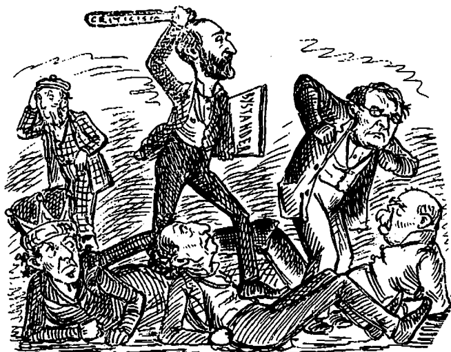
"THE BYSTANDER." ISN'T THIS RATHER A MISNOMER FOR A PARTY WHO JOINS IN THE FRAY?