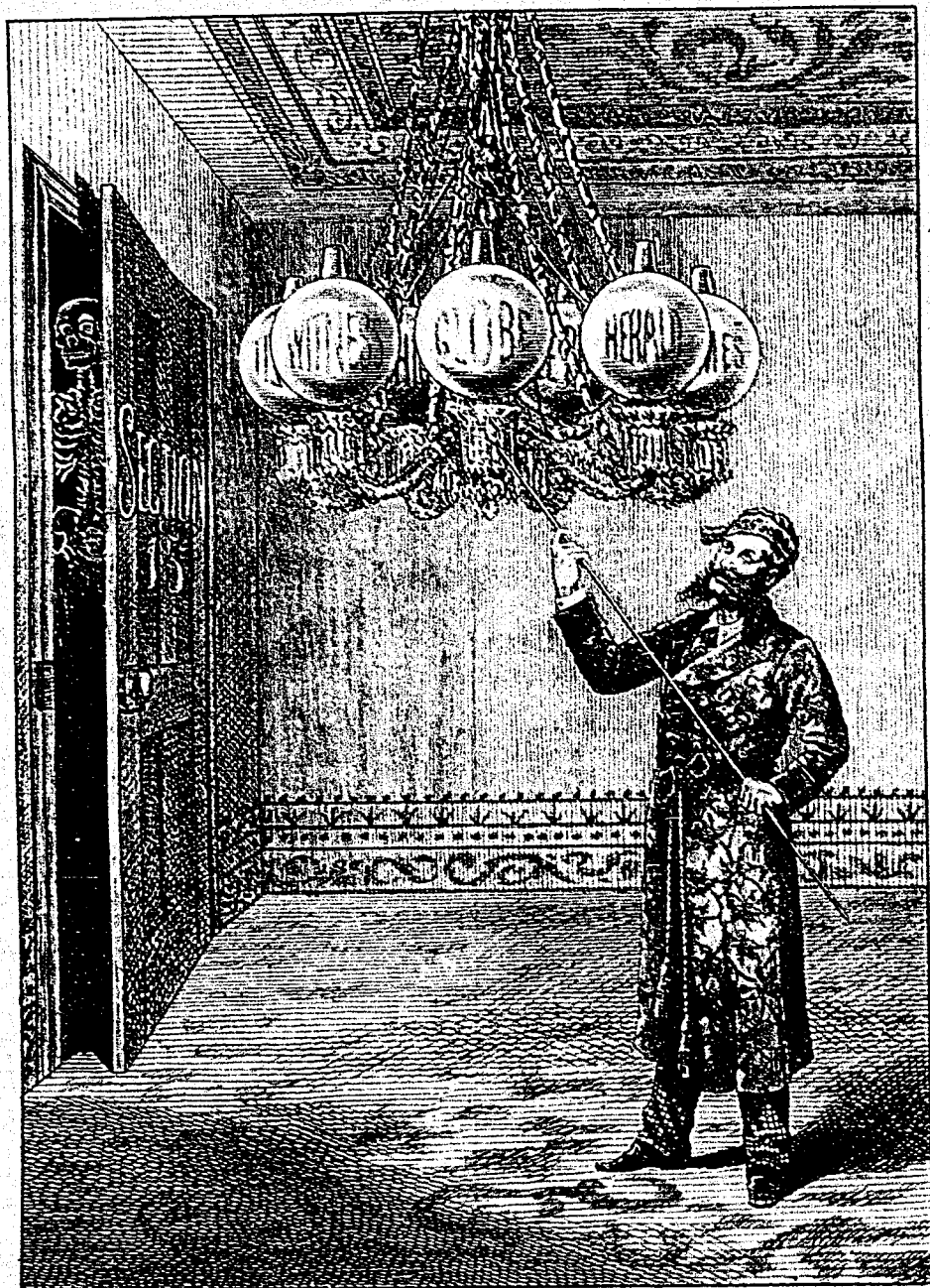
THE SKELETON IN THE CLOSET. TURN ON THE LIGHTS.

In consequence of spurious imitations of LEA AND PERRINS' SAUCE, which are calculated to deceive the Public, Lea and Perrins have adopted A NEW LABEL, bearing their Signature, thus,