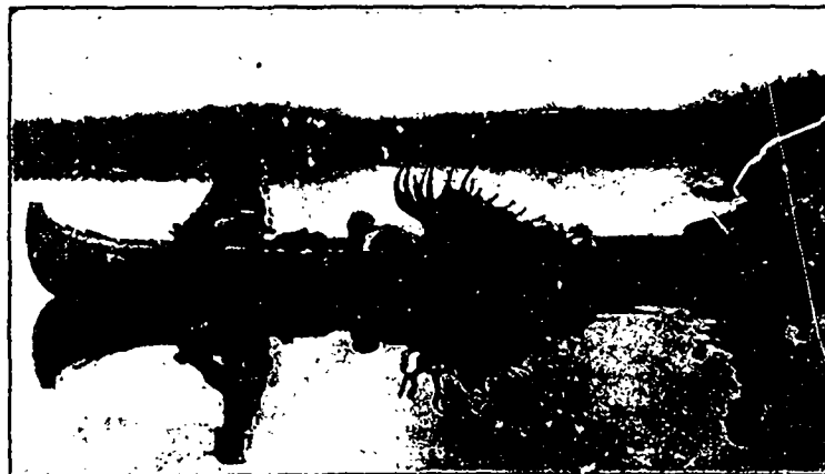
BRINGING OUT A KIPPEWA HEAD.

CARIBOU, BIGHORN, GOAT, DUCK, PARTRIDGE, SNIPE, SALMON, RAINBOW PIKE, and