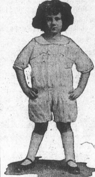
THE NEWEST ROMPERS.

Among the new shades is a soft "poussin" blue, which is seen to ad-