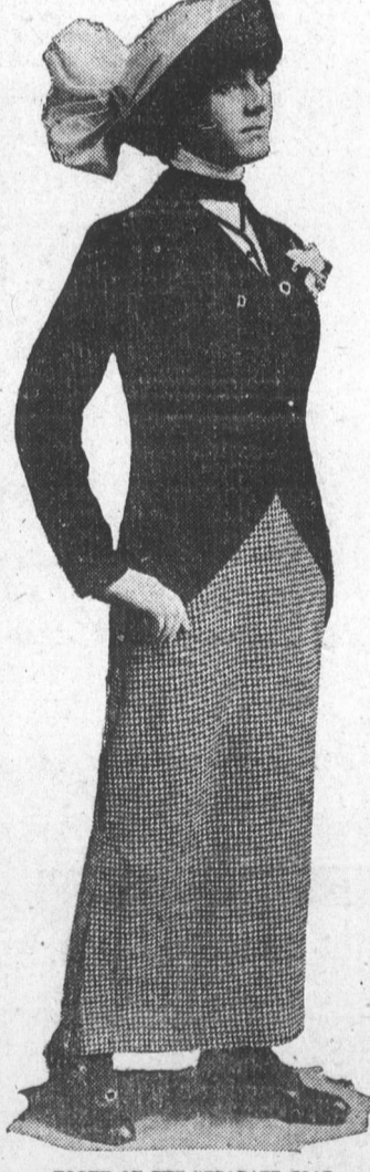
VOGUE OF THE SEPARATE COAT.

There seems to be an unwritten law in dressmakingdom that, no matter what eccentric and fresh effect may be the whim of fashion, it shall be expressed solely in costumes to be worn by day. The only unusual or fresh note in the walking suit illustrated is to be found in the combination checked skirt with plain coat. This combina-