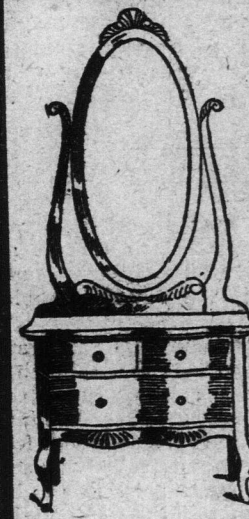
Dresser in Surface Oak. Price . . . $21.50

While we make a specialty of high grade furniture, the popular priced lines are not neglected as these values prove. The pieces are priced very low indeed.