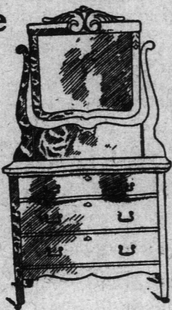
Princess Dresser in Surface Oak. Price . . . $17.00