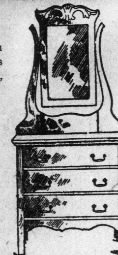
Dresser in Surface Oak. Price . . . $14.75