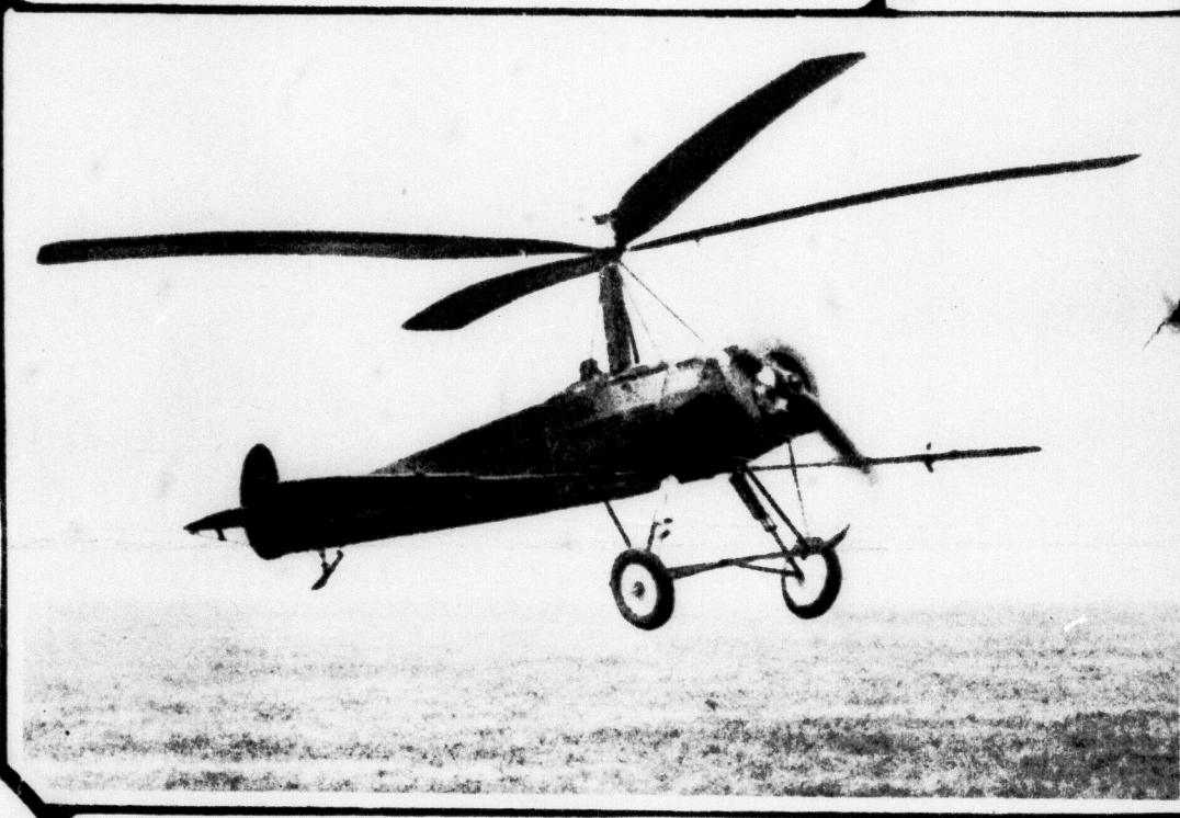
The problem of rising perpendicularly and hovering like a bird seems to have been solved by this Cinerva plane being tested at Farnborough, England