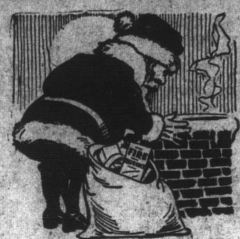
HE SEES FIRE

SNAPPY WEATHER —The weather across the railway line is extremely cold to-day. The mercury at Bishop Falls registered 15 below this morning. Quarry recorded 10 below. Humbermouth 5 below.