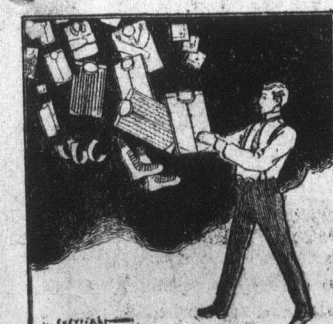
YOUR THINGS COME BACK

J. C. Wanless 4 Doors East of Market King Street