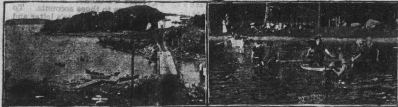
(1) Lac Marois, Shawbridge. (2) Mixed Bathing (3) Quiet Fishing Pool Near Val Morin.

LOVERS of beautiful mountain and valley scenery towering rocks, thick forests, pleasant glades, flower-clad vales and plains, rushing and placid rivers, roaring waterfalls and babbling streams could not do better than to select the Laurentian Mountains reached by the Canadian Pacific, as their holiday resort. So prettily situated are all the spots where the holiday-makers make their headquarters that it is embarrassing to choose the one that might be best suited to the taste of the individual. But all are enchanting, from Shawbridge—the first of them—to Mount Laurier—the last. Within easy reach of any of the resorts there is excellent trout and bass fishing to be had. The rivers and lakes are clear and sand-bottomed generally, and are well suited to the requirements of the swimmer and bather. Row boating, motor boating, and canoeing are favorite pastimes, and on a fine calm evening it is exhilarating to sit by the waters and listen to the laughter and merry chat of the parties who are on the waters.