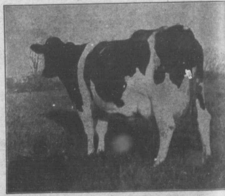
Midnight Comet Dekol.