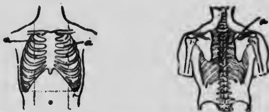
CASE I. FIG. 2 -a. Impaired resonance; no rales. July 16th, 1901.

country, where she lived with relatives during the whole winter, and was examined on the 2nd May this year, the extent of the disease being noted on the accompanying Fig. No. 1. The condition at this time was distinctly caseous , and the amount of expectoration sometimes