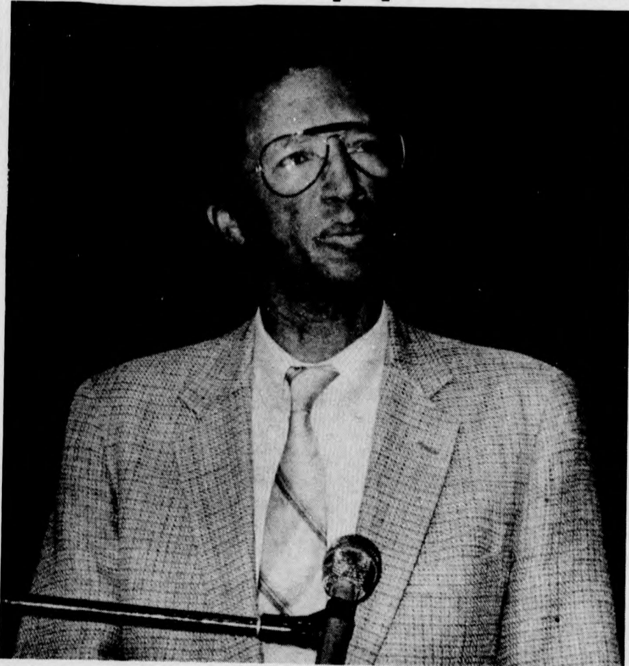
Arthur Ashe at Burton Auditorium on weekend