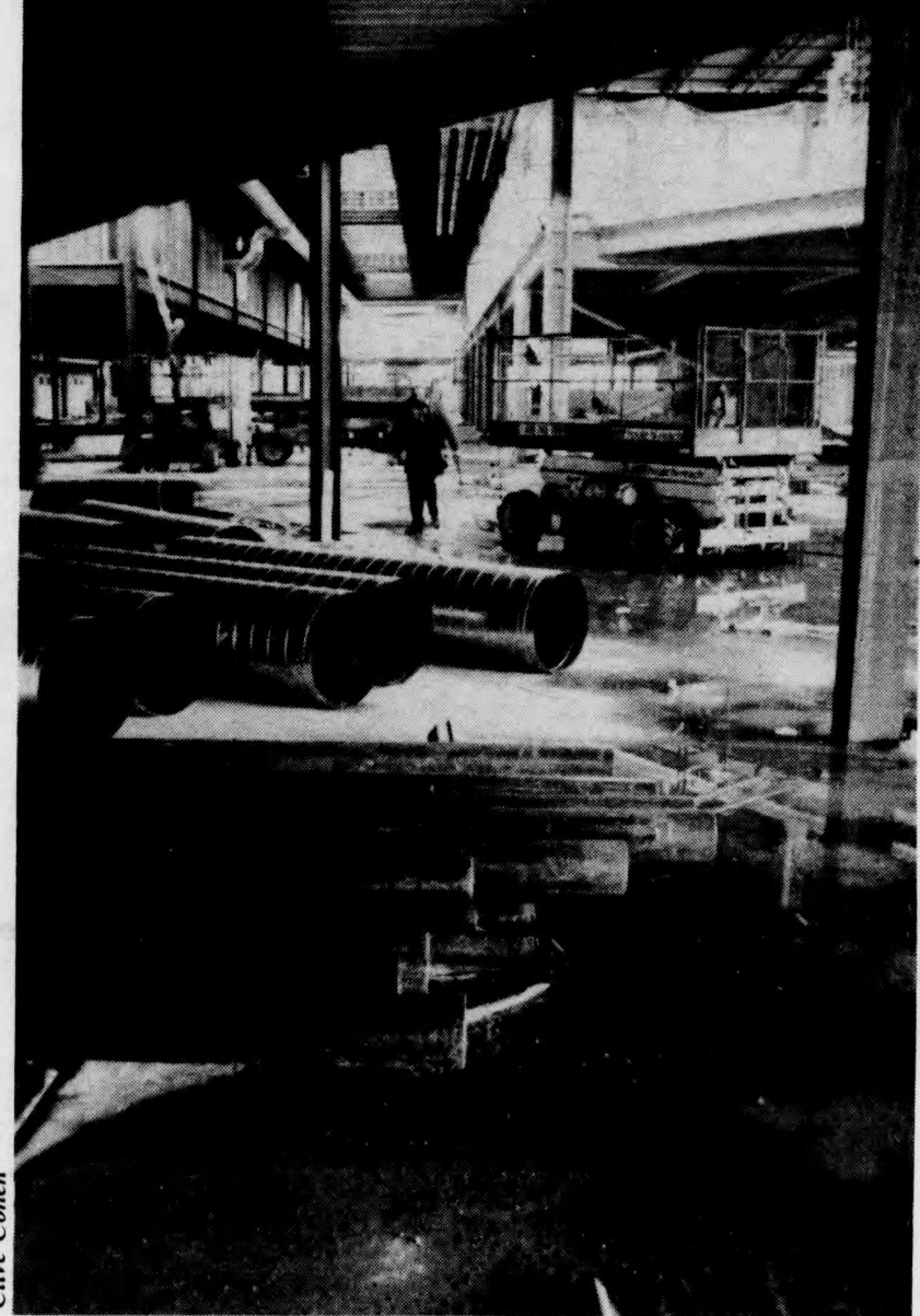
York Lanes: the administration-owned mall will be competing with the Student Centre for students' money when both buildings are completed.

"Who else is supposed to make the request?" asked Abrams. "The YFS sponsored the referendum!" continued on page 3