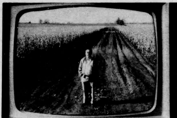
is neither rich nor poor."