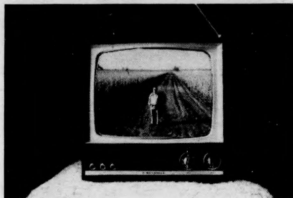
"This ordinary guy..."