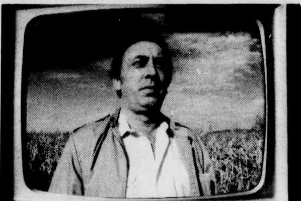
"And does not want to be on your town council."