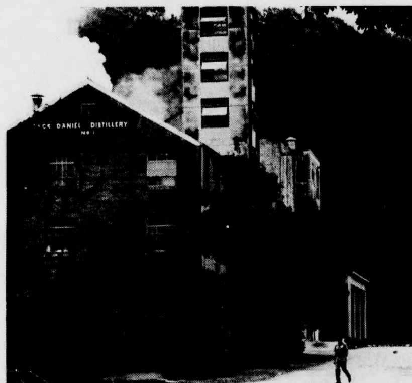
Jack Daniel Distillery. Named a National Historic Place by the United States Government.

AT THE JACK DANIEL DISTILLERY, we have everything we need to make our whiskey uncommonly smooth.