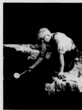
Our own iron-free water

AT THE JACK DANIEL DISTILLERY, we have everything we need to make our whiskey uncommonly smooth.