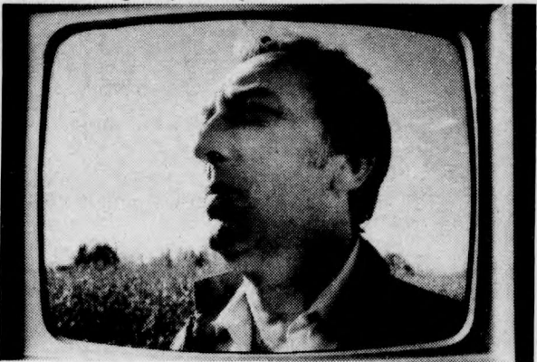
"However, this is his only means of earning a living."