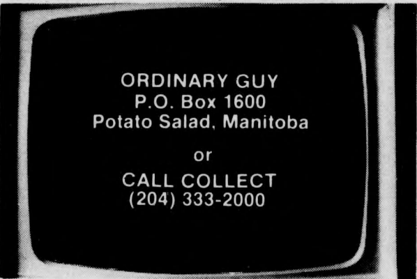
"Please, act immediately..."