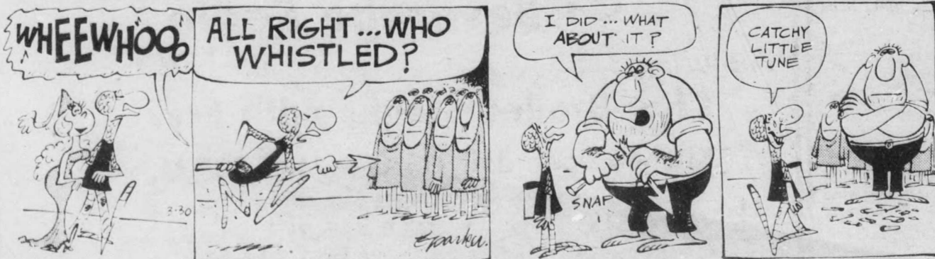
by Brant Parker and Johnny Hart