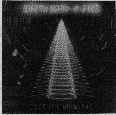
☐ Earth Wind & Fire - Electric Universe - all new LP.