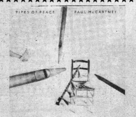
□ Paul McCartney - Pipes of Peace featuring hit single -"Say Say Say"