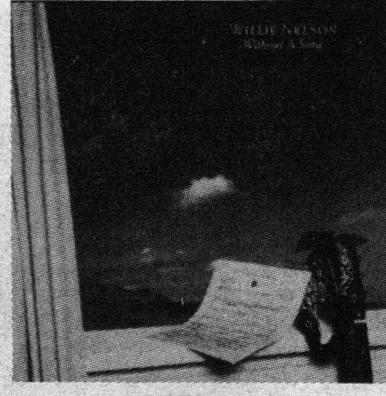
□ Willie Nelson - Without A Song newest, includes duet with Julio Iglesias