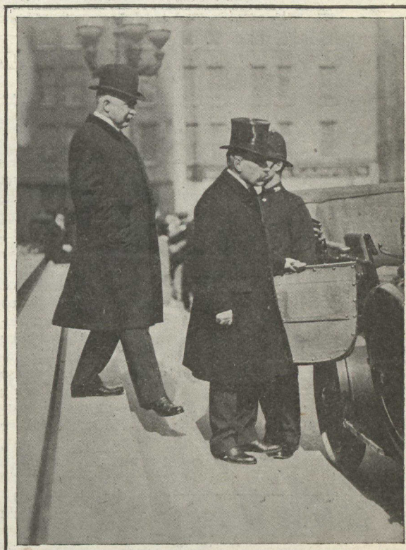
The Prime Minister and Hon. A. E. Kemp Leaving the City Hall After the Civic Reception.