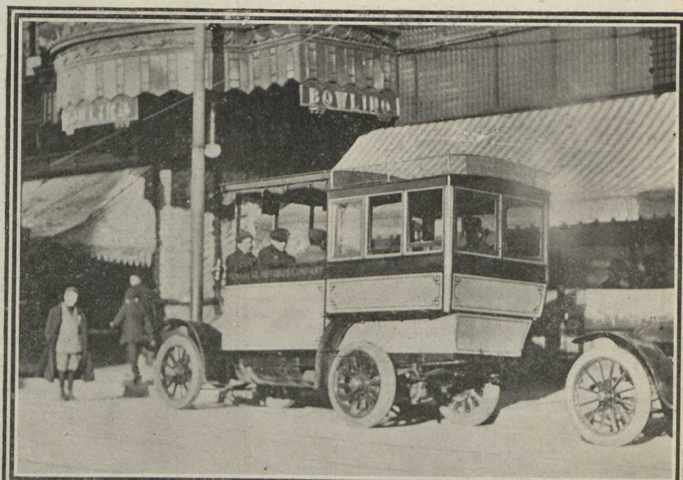
Another View of the Autibus in Operation. They Run from 8 a.m. to 12 Midnight. The First Rate Was Ten Cents, But This is to be Reduced to Five Cents When the Service Grows. The Promoters Say Over 2,000 Buses Will be Required Ultimately.