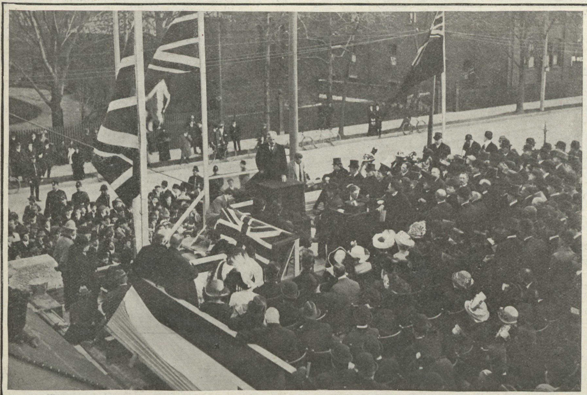
A Section of the Big Crowd Which Saw Premier Borden Lay the Corner-stone of the Central Y.M.C.A., Toronto, on Tuesday of Last Week.