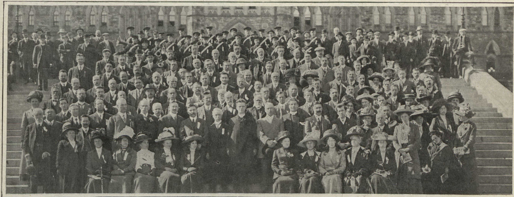
On Their Way to the Convention of the International Brotherhoods at Toronto, the British Brotherhood Delegation Spent a Day in Ottawa, Where They Were Welcomed by Premier Borden and the City Council.