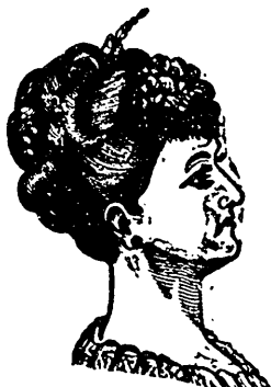
After wearing Dorenwend's Coverings, in Wigs or other shapes

LADIES as well as GENTLEMEN whose hair has become thin, and in some cases the head completely bald should send for particulars and read about the many different kinds of coverings we manufacture. It matters not what shade of hair is wanted, nor what size or shape the head is, we have and manufacture Coverings that are bound to suit, and will make the wearer look and feel better, and will in every way give that satisfaction that is desired. At present our stock for variety in tasteful styles is the largest since we have been in business, and in order to reduce it we have marked down prices so low this month that every one in need of a good article should take advantage of the reduction made, and get what is needed.