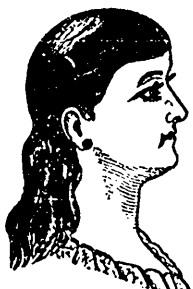
Before wearing Dorenwend's Coverings.