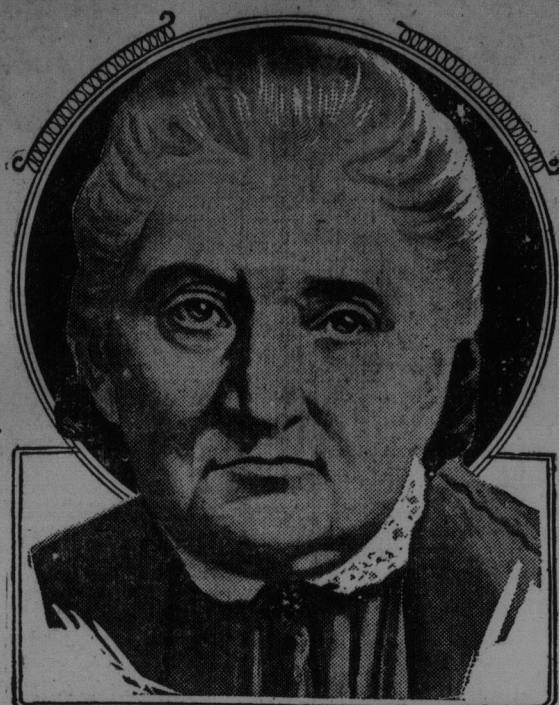
MME. CATHERINE BRESHKOWSKAYA.