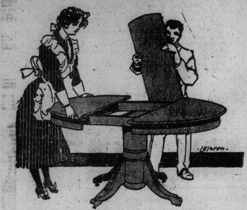
Members of our Former Clubs are prima facie members of this July Club. Five hundred new members will be admitted. Join at once if you need Carpets, Rugs, Window Draperies, Furniture, or any goods sold in those respective departments.

WE take pleasure in announcing to-day that on Wednesday next we will re-open our Housefurnishing Club for the entry of 500 new members. Ex-membership also will be renewed upon application.