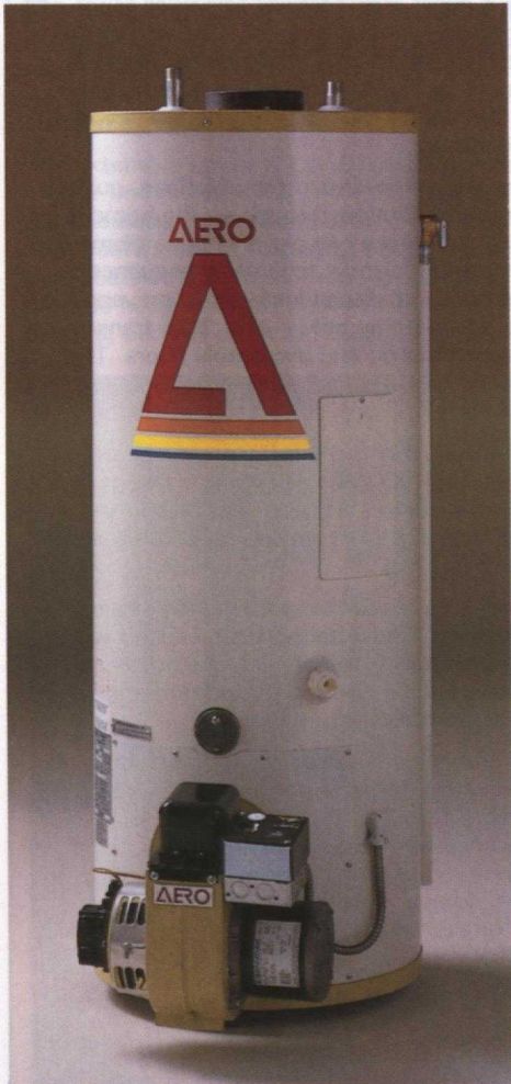
Oil-fired Aero water heaters in both centre-flue and rear-flue designs are equipped with a high-efficiency flame retention burner and glass-lined tank.

Green Limited 1740 Tupper Drive Mississauga, Ontario Canada L4T 1H9 Tel: (416) 678-2500 Fax: (416) 678-2581