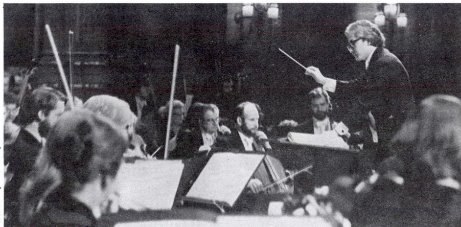
Maestro Akiyama conducts the Vancouver Symphony in their first concert

Despite irritants and problems – which we are in the process of correcting – the official languages program is succeeding. We have now reached the stage where we are able to shift the emphasis to greater support for teaching French in the schools – where it should be taught – rather than in crash programs for public servants. This change is now possible because in contrast to the 1960s, we can generally provide federal services to the public in either official language; francophone participation in the Public Service is increasing without harming the opportunities of English-speaking Canadians for government careers.