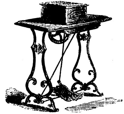
Casket Machine, Complete. Price $30.00.

The above cuts show the style of two of our LOW PRICE DOUBLE-THREAD MACHINES, which we can strongly recommend for all kinds of family purposes, as being equal to any Machine ever made. In addition to the above, we also build the following popular styles of Sewing Machines for Family and Manufacturing purposes:—