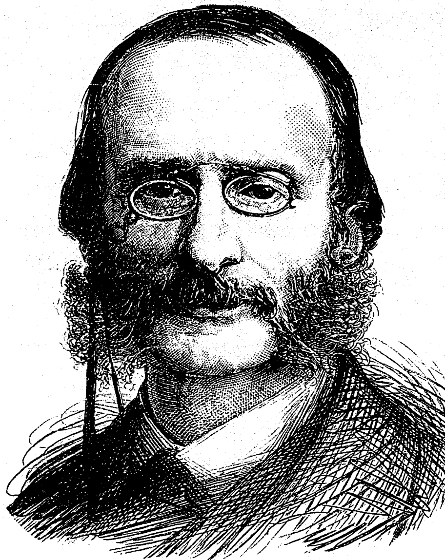
THE LATE JACQUES OFFENBACH.